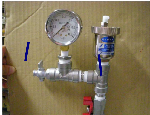
Primal pressure gauge Input adjustment valve